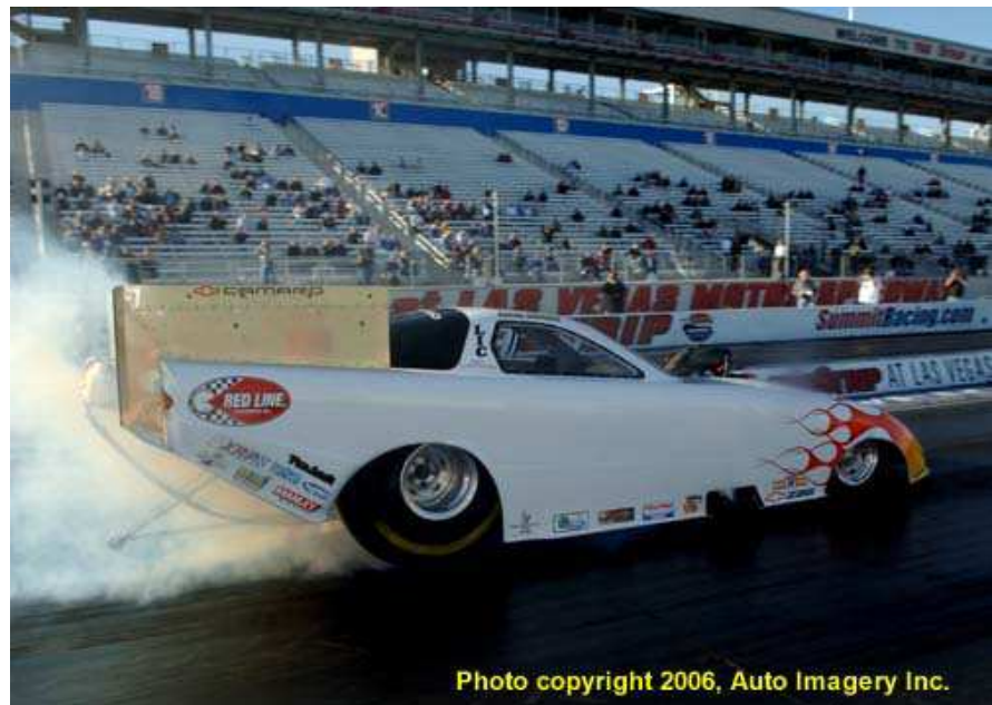
License Pass in Vegas 2006