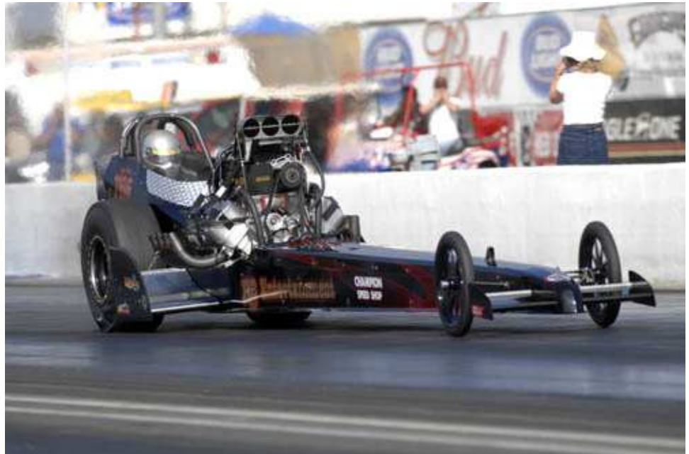
Hooked up and Hauling!

An NHRA Fuel Funny Car, Nostalgia Top Fuel Dragster, Alcohol Funny Car, Super Comp Dragster, Nostalgia Junior Fuel Dragster, NASCAR Southwest Tour Car, Formula Ford, Spec Car Renault, SCCA Improved Touring B class, Legends, Karts (KT 100, Superbox, 80cc & 125 shifter) and... he even drove the caboose car in a figure eight train race once!